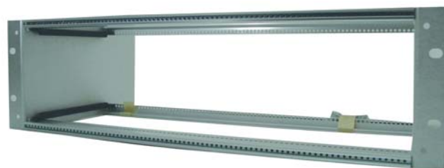
CCA160-3U shown with 1 pr. of CG1-160 card guides installed